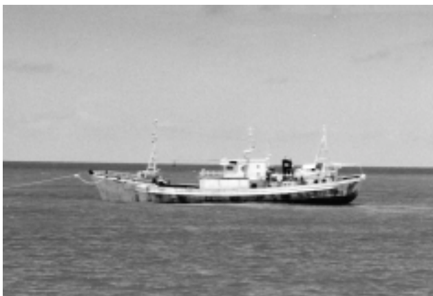
Indonesian fishing vessel Pratidina 05 aground on Turu Cay

The Pratidina 05 , a 30 metre Indonesian fishing vessel, was found by a Coastwatch surveillance flight grounded on Turu Cay on 17 November 2000. Turu Cay is located in the Arafura Sea about 40 nautical miles (nm) south of Irian Jaya and approximately 65 nm to the north west of Thursday Island.