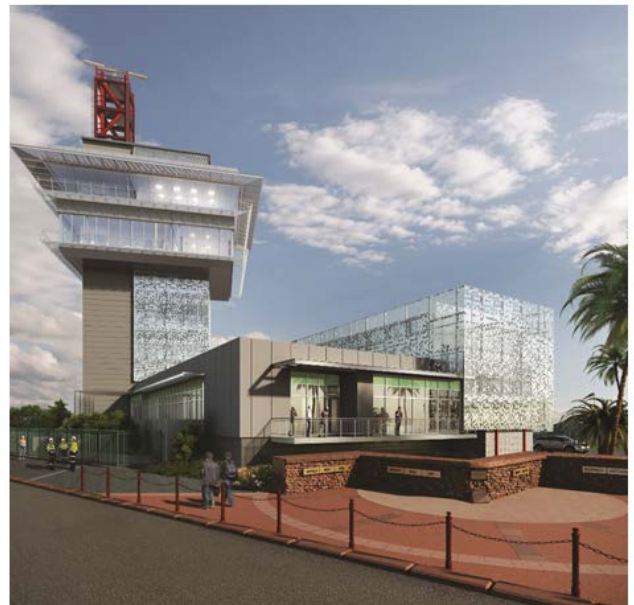
Concept design of the new IMOC, Port Hedland

The facility will also house the port's dredging management, port security, Maritime Security Identification Card office, marine pilot facilities and a dedicated Incident Control Centre.