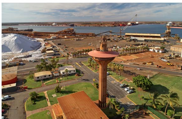
Images of current Shipping Tower in Port Hedland

Pilbara Ports, Port Hedland was authorised as the VTS Authority for Port Hedland VTS on 8 July 2015, to operate and provide an Information Service (INS) and a Traffic Organisation Service (TOS) in line with the requirements of Marine Order 64.