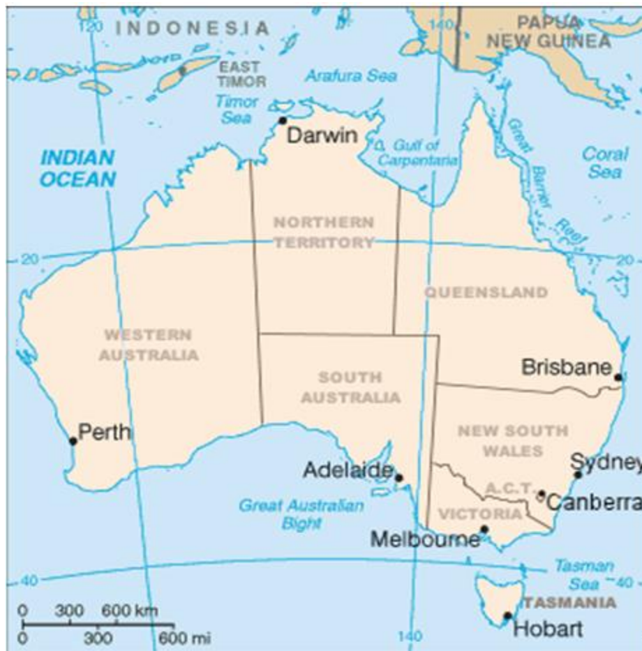
Figure 3: Australian States and Land Search Areas

1.6.1 The Police Services in each State and Territory are responsible for Land Search and Rescue within the boundaries of their respective State or Territory, including any islands. The ACT is also responsible for a small area of land at Jervis Bay, NSW.