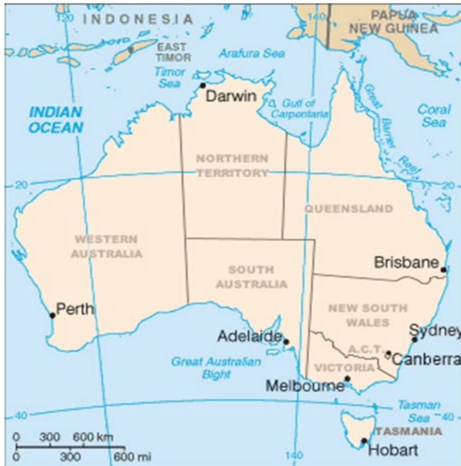
Figure 3: Australian States and Land Search Areas

1.6.1 The Police Services in each State and Territory are responsible for Land Search and Rescue within the boundaries of their respective State or Territory, including any islands. The ACT is also responsible for a small area of land at Jervis Bay, NSW.