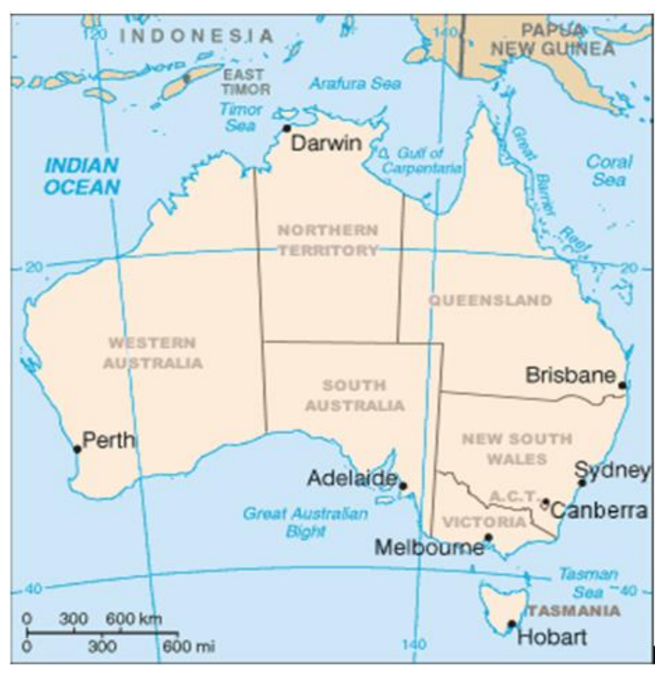
Figure 3: Australian States and Land Search Areas

1.6.1 The Police Services in each State and Territory are responsible for Land Search and Rescue within the boundaries of their respective State or Territory, including any islands. The ACT is also responsible for a small area of land at Jervis Bay, NSW.