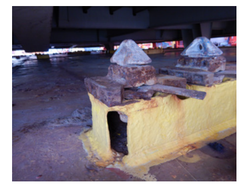
Corroded raised ISO sockets.

Containers must be stowed and secured for the most severe weather conditions which may be expected for the intended voyage. Actions to increase lashings should also be considered before conditions deteriorate to the point that they are required.