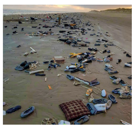
Environmental impact from the MSC Zoe incident. Image supplied.