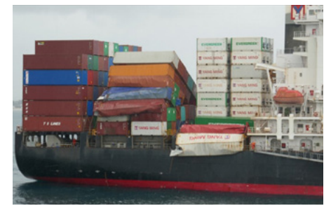
Containers on the YM Efficiency toppled over and falling into the sea. Image supplied.

The ship's master and chief mate did not check that the proposed container stowage plan complied with the requirements of the Cargo Securing Manual.