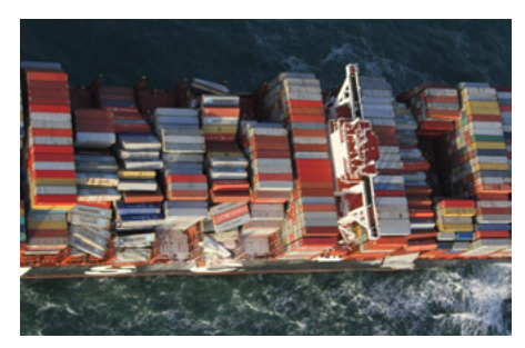
Containers on the MSC Zoe toppled over and falling into the sea. Image supplied.

The loss of containers resulted in environmental damage to the Wadden Islands, Netherlands, which are considered to be a unique and vulnerable natural habitat.