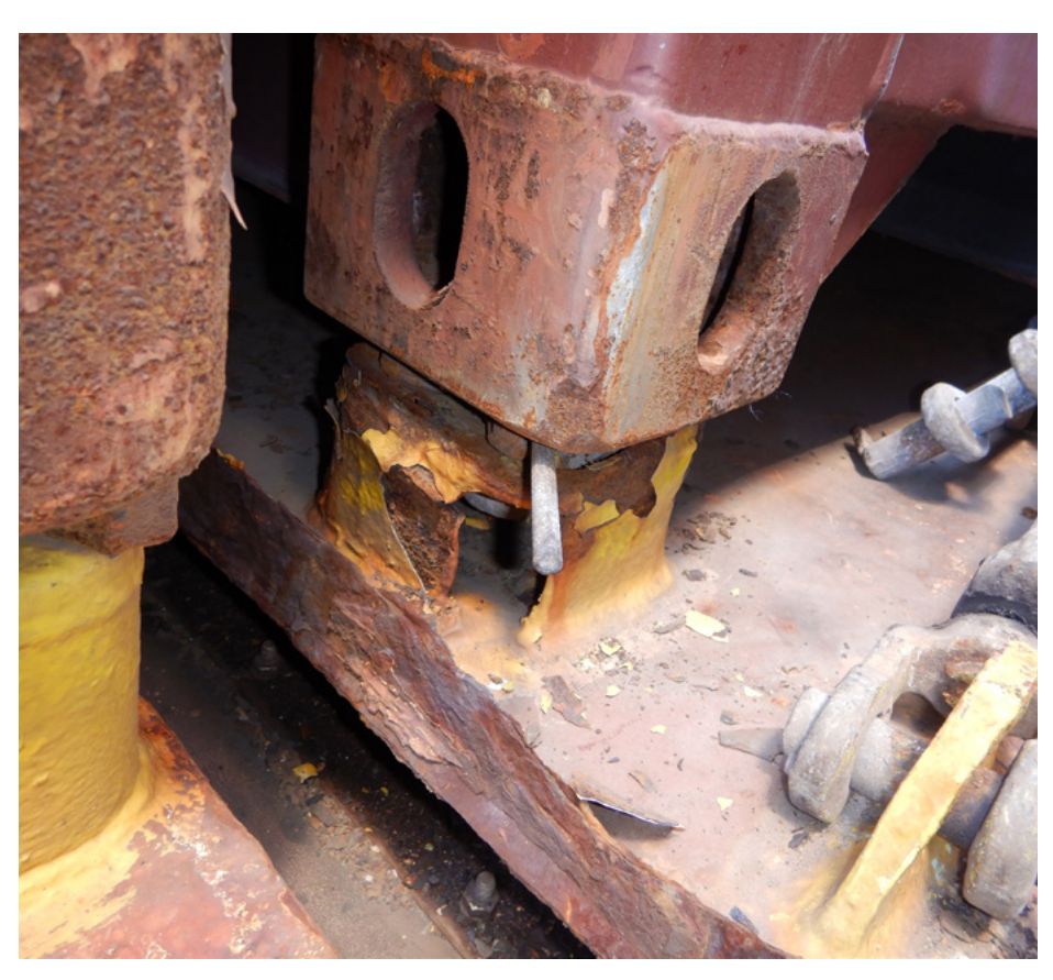
Corroded and cracked raised ISO socket