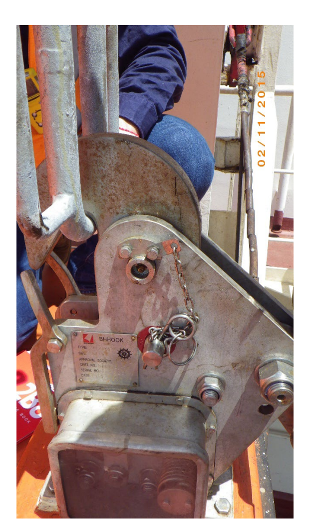
Safety Pin fitted