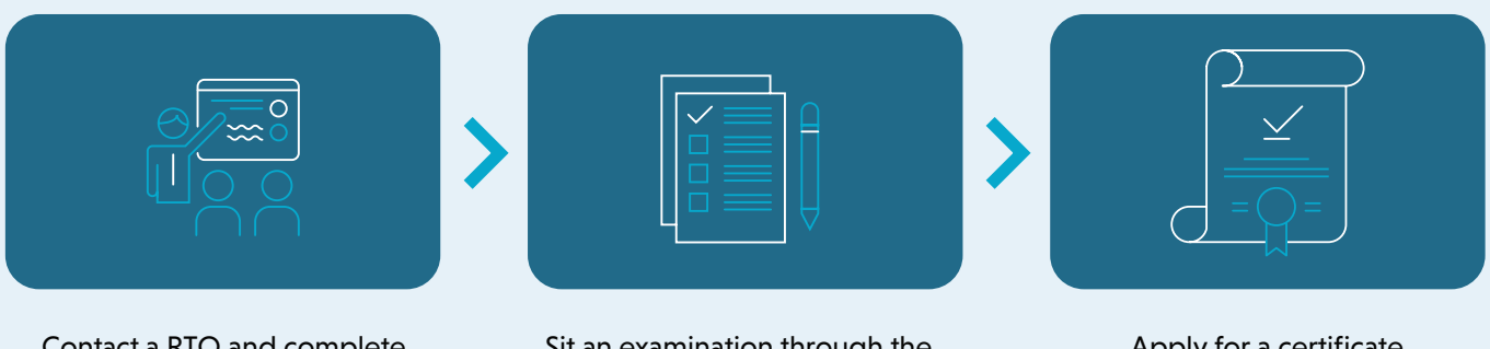
Contact a RTO and complete the required course

To work on a vessel, you and your crew will require a certificate of competency or an exemption. A registered training organisation (RTO) can advise you of your training requirements and the best courses to fulfil your needs.